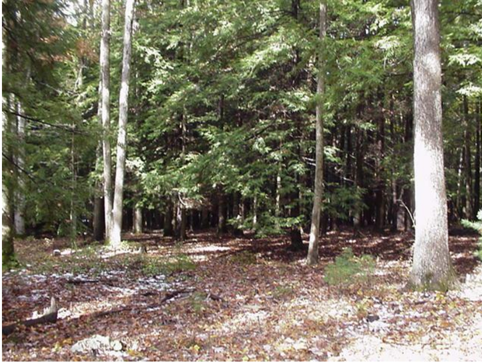
Figure 2. No maintenance site on Laurel Run Road, in Whipple Dam State Park and Rothrock State Forest, Huntingdon County, PA, 2002.