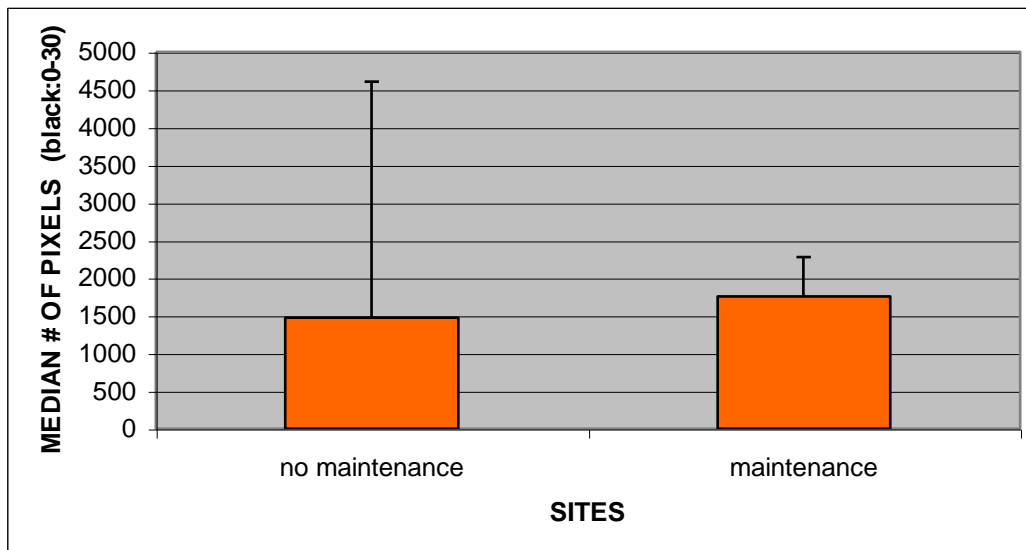
Figure 5. Median number of black pixels from each site in Rothrock State Forest, Huntingdon County, Pennsylvania, 2002.