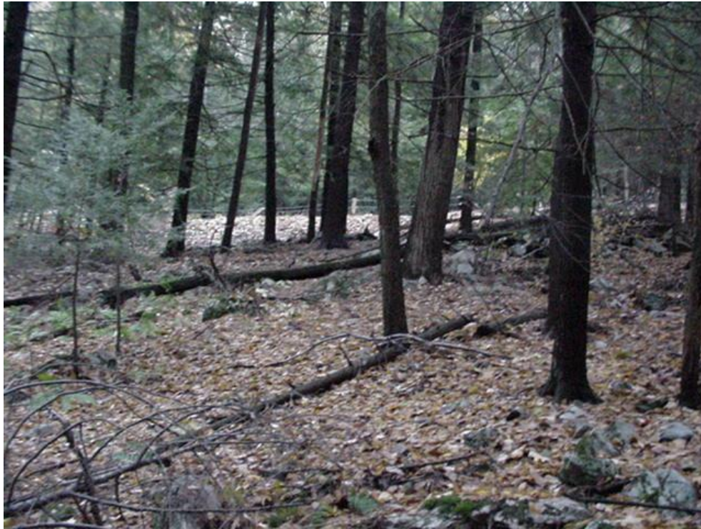
Figure 3. Maintained Site along route 305 between Greenwood Furnace and Bellville, 30 meters from the road in Rothrock State Forest, Huntingdon, PA, 2002.